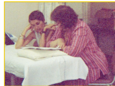
Delegates hard at work

ANSA achieved two 'first's' with the recent clinical skills training day. It was the first time we had hosted such a subject, which was enthusiastically well evaluated and enjoyed by all our attendees. Our learning experience was enhanced by the informal environment in the clinical classroom at the Sherman Education Centre at Guy's Hospital.