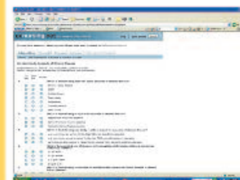
Picture 2. Pre and post-test questionnaire