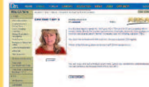
Picture 1. A case based approach with multiple choice questions