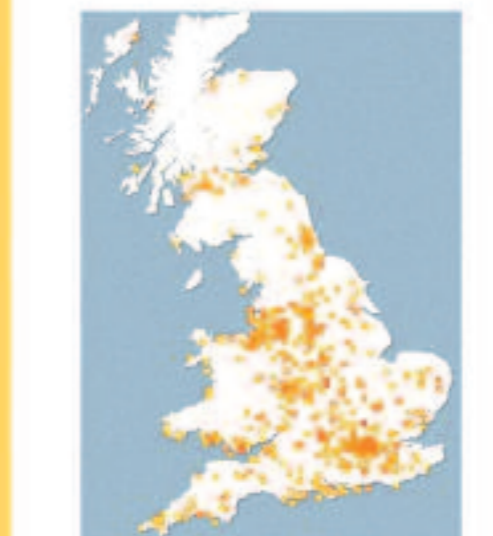
Picture 4. Geographical distribution of HCP accessing module 1 has been supported by an established education partner (www.anaemianurse.org)