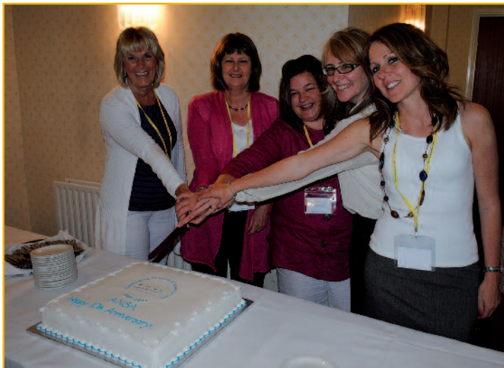
The five ANSA Presidents cutting the ANSA 10th Anniversary cake